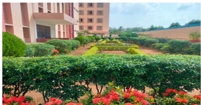
Figure 01: open areas in Trident Academy of Technology