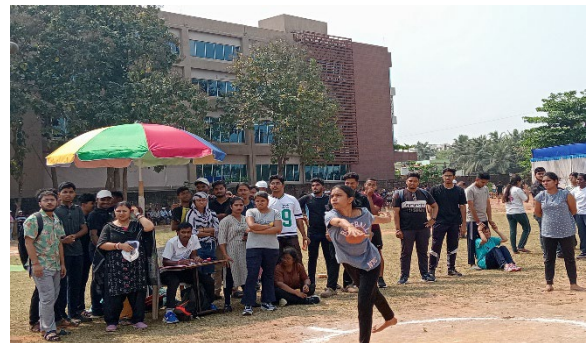
Figure 02: Intercollege Sports competition in college campus