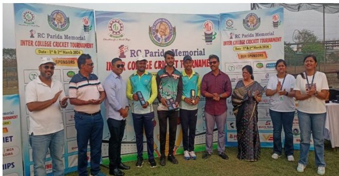
Figure 02: Intercollege cricket

There are open areas on the campus that provide a natural environment where students and staff can relax, exercise, or engage in recreational activities. These spaces offer a break from the classroom or office environment and can improve overall well-being. These open areas can also be used for various campus events. The play grounds on the campus fosters encouraging participation in sports and contributing to overall student well-being and academic success. There are badminton courts, football and basketball courts, cricket ground which are open to the students of even other universities during Sports competitions and annual festival of the Institute.