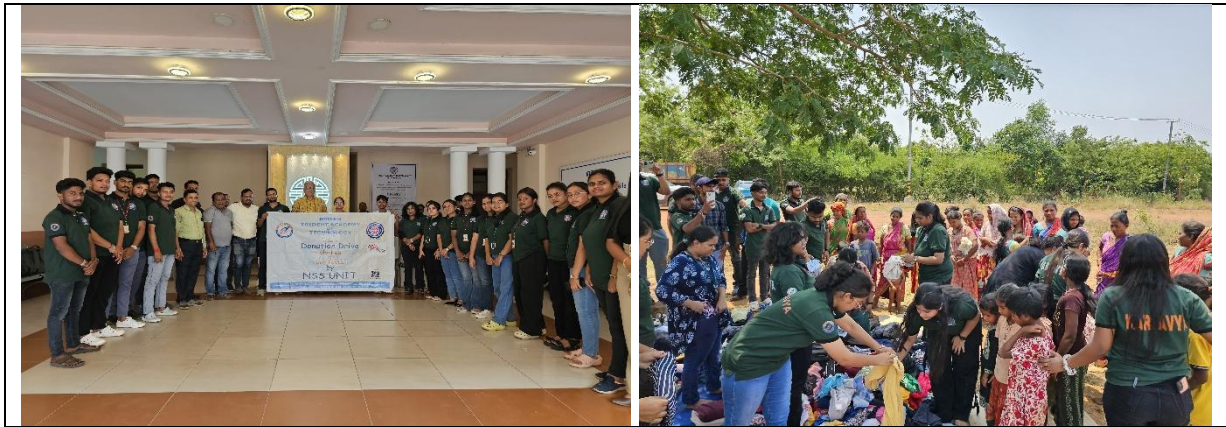
Plate 2- Trident Academy's and Kartavya Club Host Successful Food and Dress Distribution Drive in Mundasahi.

2.3.2 STUDENTS HUNGER INTERVENTIONS.YEAR: 2023