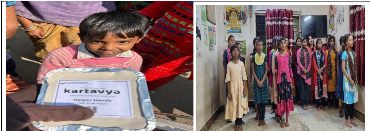
Plate 3- Trident Academy's Kartavya Club Host Food Distribution Drive in each month near by Road side and Orphanages.

2.3.2 STUDENTS HUNGER INTERVENTIONS.YEAR: 2023