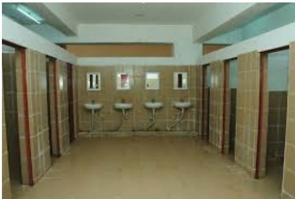
Image-1-toilet for disabilities

Provide accessible facilities for people with disabilities