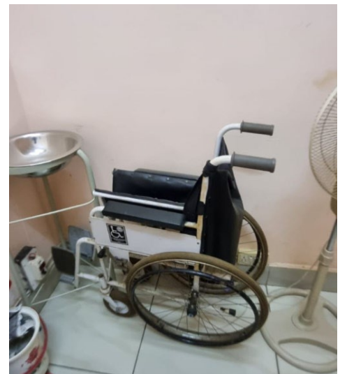
Image 4-Wheel Chair