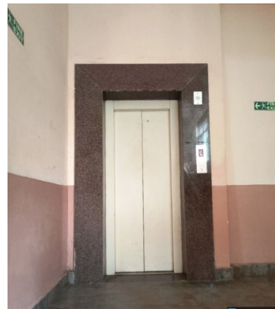
Image-2- lift for disabilities