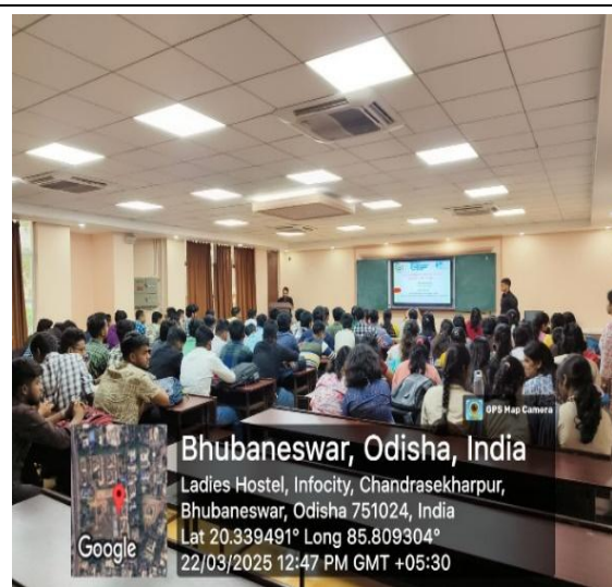
A session on “ IEEE Membership Awareness and Sensitization” on 22/03/2025