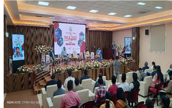
The two-day National Conclave on “Energy, Semiconductors, Cyber security, and AI- i.e. ESCA-2025” on 14 th & 15 th February