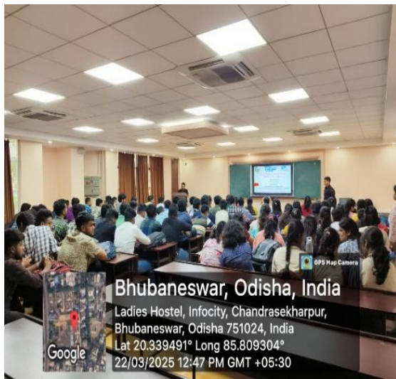
A session on “ IEEE Membership Awareness and Sensitization” on 22/03/2025