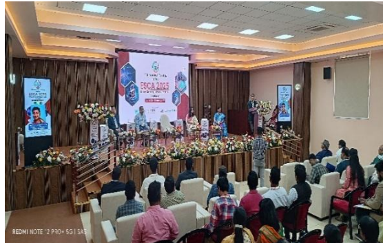
The two-day National Conclave on “Energy, Semiconductors, Cyber security, and AI- i.e. ESCA-2025” on 14 th & 15 th February